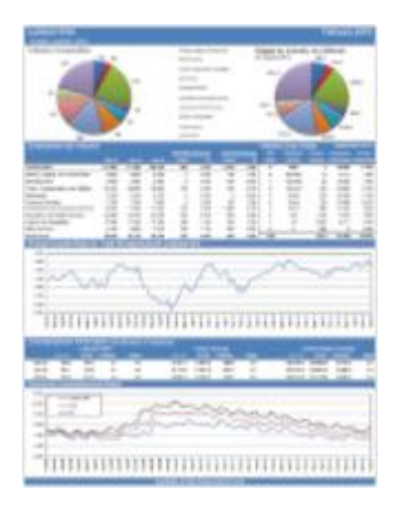
Click image to view full report: Lubbock Metropolitan