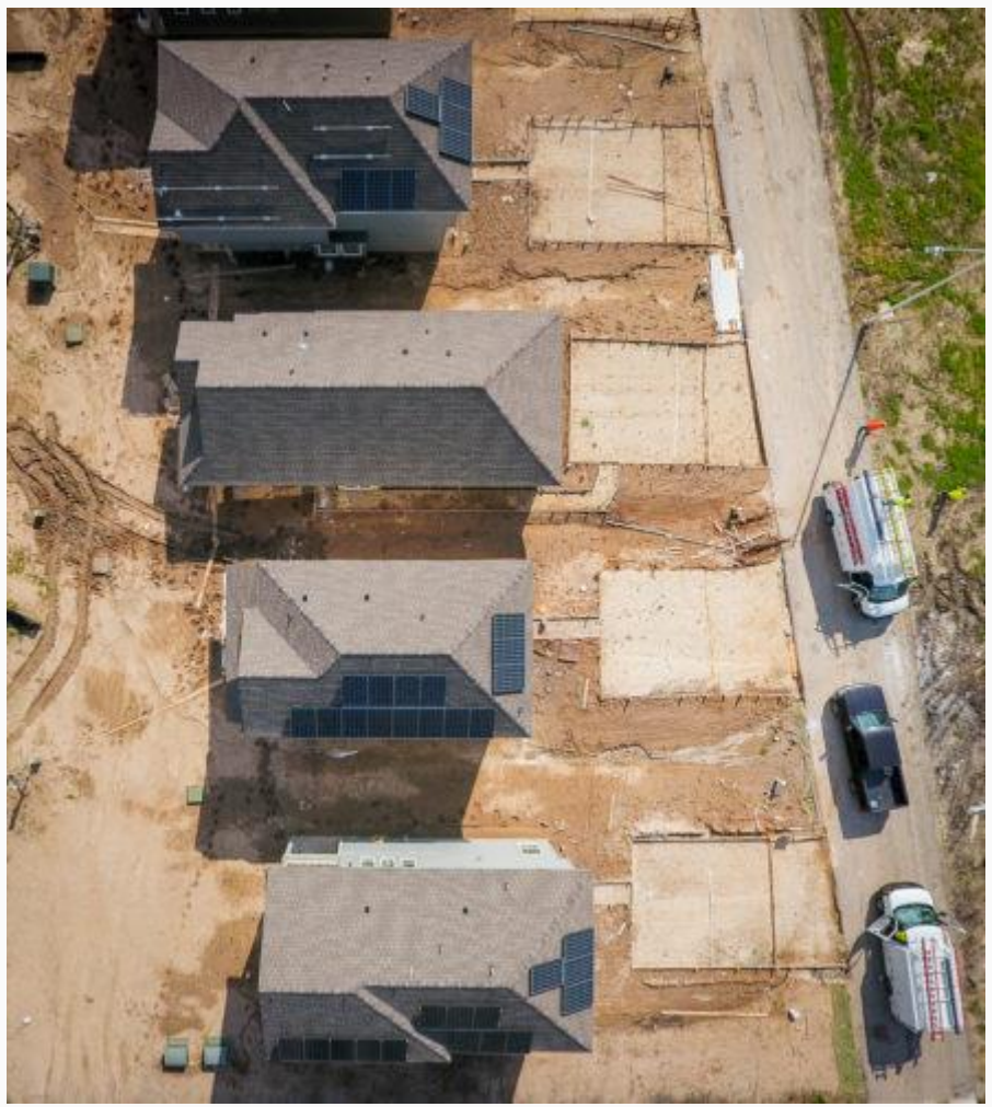
Freshly built homes in the Whisper Valley development east of Austin, Texas await or sport rooftop solar arrays. The net-zero capable community will boast 7,500 homes upon completion. Francis Solar

spaces like a wellness center, swimming pool, organic gardens and 700 acres of open space will also be available to Whisper Valley residents. There will even be a middle and elementary school in the development.