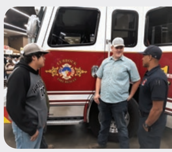
Many students visited with firefighters from Lubbock Fire Rescue about careers in the Law and Public Safety career cluster.