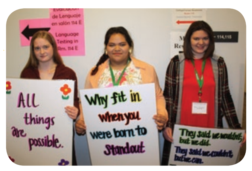
Students display the posters they made for the style show during United We Work Day.

It was a day of mock job interviews, job shadowing professionals at their workplace and a style show in February 2019 which was designed to help students with disabilities feel more comfortable when seeking employment. The annual United We Work Day saw 90 students from 7 ISD's and 17 employers participate. The event allowed students to explore their interest in pursuing various careers.