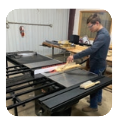
Roosevelt High School students in the Construction Technology class prepare for careers in the construction industry.