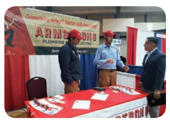
Representatives from Armstrong Plumbing and Electric visit with a veteran about what their organization offers to employees.

Last year, 599 veterans and their spouses received WSSP services from the career center.