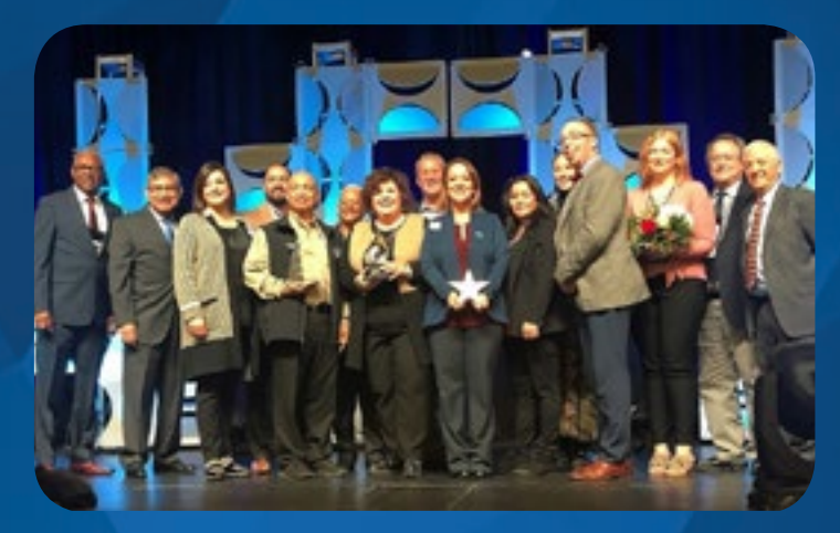
GINWT and WSSP representatives accept the 2019 Small Employer of the Year award at the Texas Workforce Commission State Conference.

GINWT was chosen from among three exemplary finalists, out of 21 others nominated by workforce boards from across the state. GINWT was recognized for their contributions to their community's workforce through innovation and collaboration with WSSP.