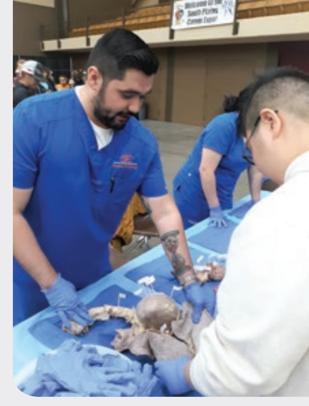
South Plains College Surgical Technology department displayed pig organs for students to touch and examine.