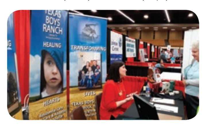
A representative from Texas Boys Ranch visits with an attendee about employment opportunities at the ranch.