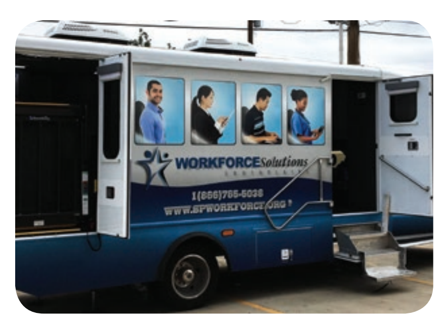
Workforce Solutions South Plains' Mobile Career Center