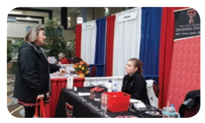
Texas Tech University is always a veteran-friendly employer.